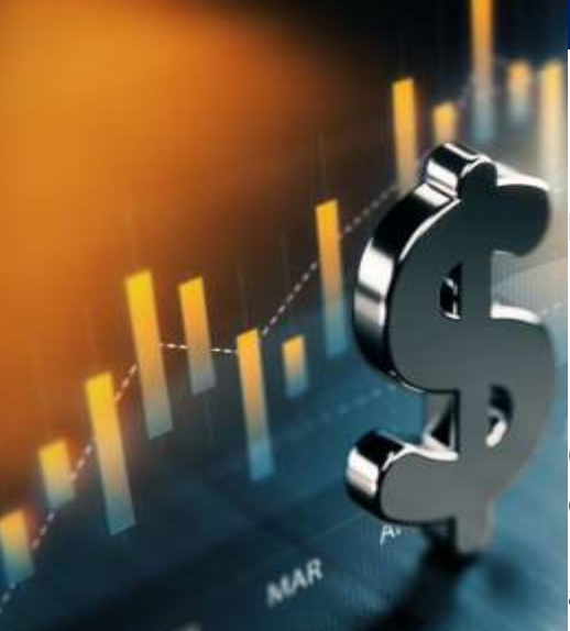
Regulatory & Compliance services